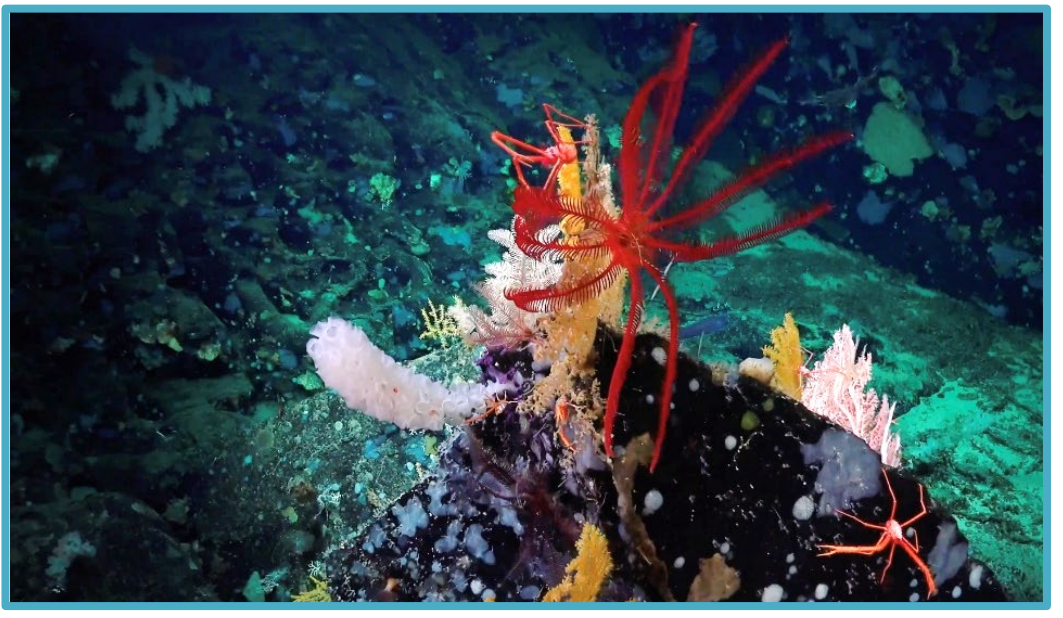
Invertebrates on Seamount 7, Costa Rica Margin. While often overlooked, the deep ocean contains a wide range of biodiversity critical to planetary health. Brightened for visibility.

Life in the deep ocean (200 meters or more below the surface) plays a central role in the marine carbon cycle by fixing, transferring, storing, and sequestering carbon from surface waters, forming the largest carbon reservoir on the planet. These processes have allowed the ocean to absorb 90% of excess heat and 25% of CO<sub>2</sub> released into the atmosphere by human activities. Their resilience depends on maintaining high productivity and diversity of species and ecosystems capable of performing these critical functions.