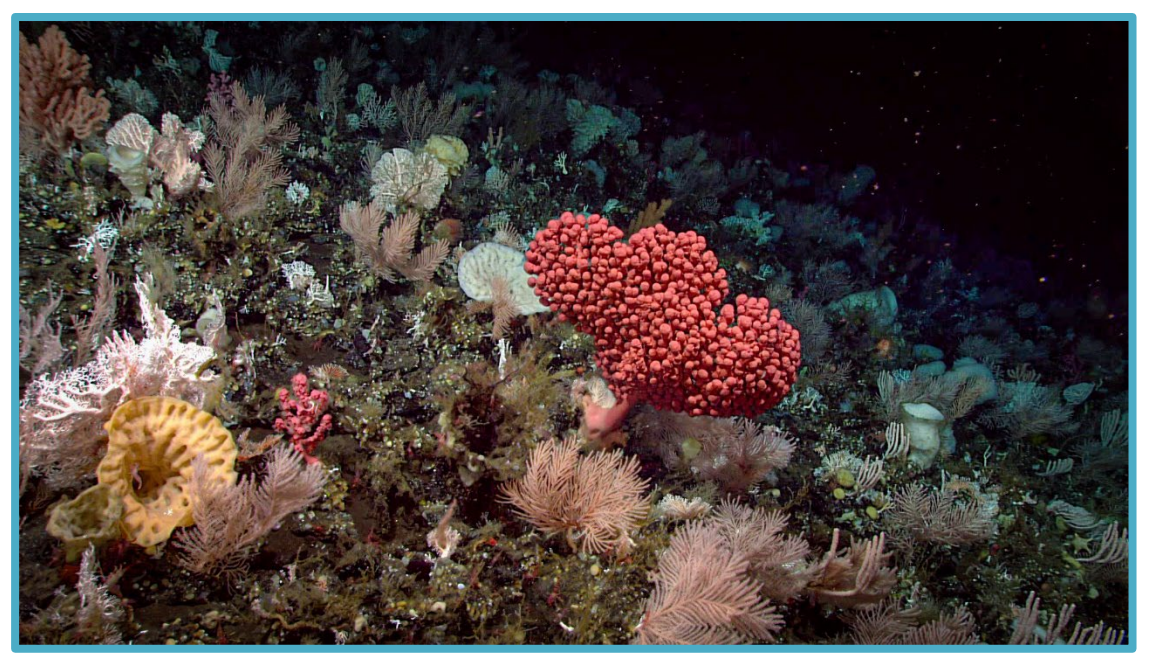
A coral and sponge community seen near the Aleutian Islands during Dive 07 of the Seascape Alaska 3 Expedition in July of 2023.